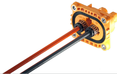
SINGLECORE CONNECTION WITH DISTRIBUTOR