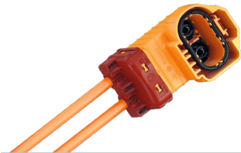
SINGLECORE CONNECTION WITH DISTRIBUTOR